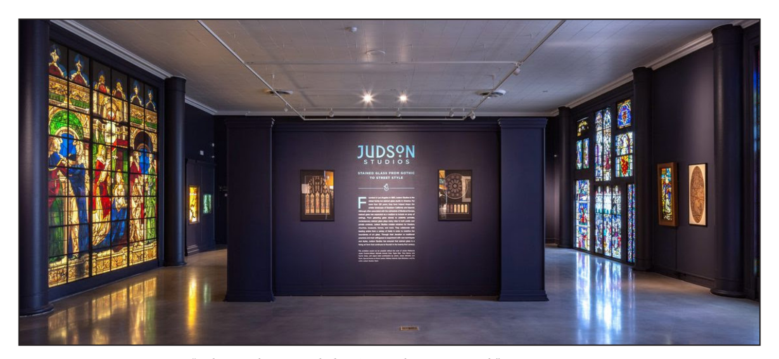
"Judson Studios: Stained Glass from Gothic to Street Style" at Forest Lawn

The event is held in conjunction with Forest Lawn Museum's current exhibition, "Judson Studios: Stained Glass from Gothic to Street Style," which runs through September 12. The exhibition includes nearly 100 original stained glass artworks, preparatory drawings, watercolors, and archival photographs as well as collaborations with contemporary artists that redefine traditional stained glass.