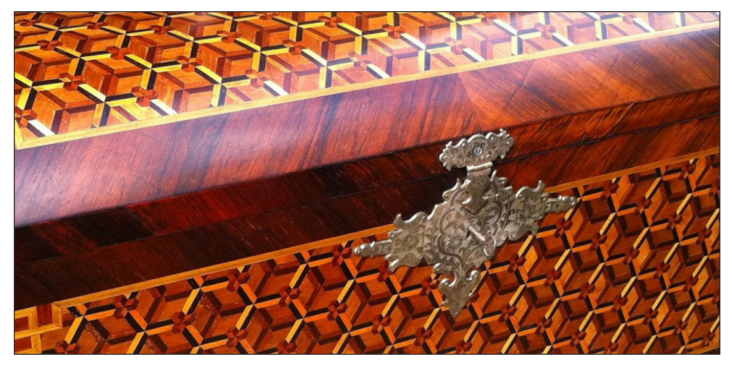
Marquetry example from Patrick Edwards' website: <u>http://wpatrickedwards.blogspot.com/</u>