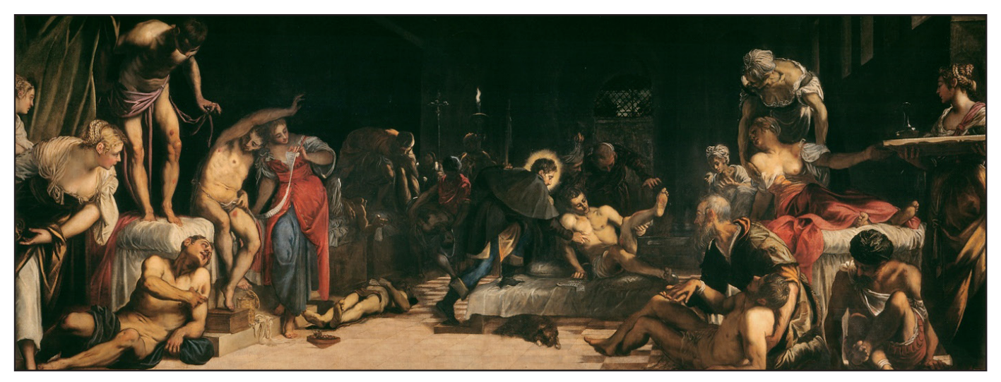
Tintoretto: "St. Roch Visiting the Plague Victims"